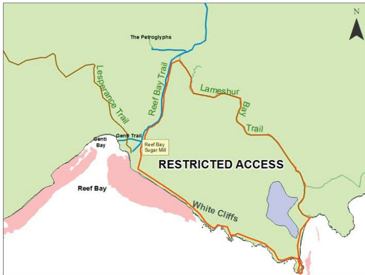
Figure 1. White Cliffs

Determining Factors: The temporary closure is necessary to protect a Territorially Endangered endemic rare plant whose global range consists of a few hundred individuals within VIIS. Repeated unauthorized trail making within this area resulted in the cutting of this and other rare plants, some of which grow less than one-half millimeter per year; some individuals are over 500 years old. Illegal trail making also facilitates corridors for the movement of exotic wildlife, leads to unwanted dispersal of non-native seeds and increases sedimentation onto adjacent wetlands, which occur on the east and west sides of the closed area. No designated NPS trails are within this closed area.