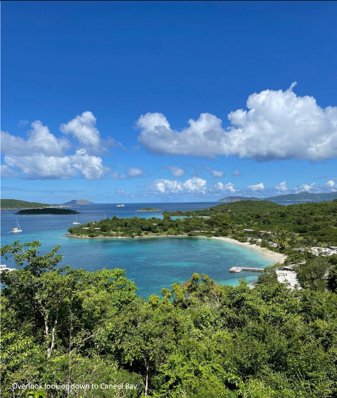
Overlook looking down to Caneel Bay