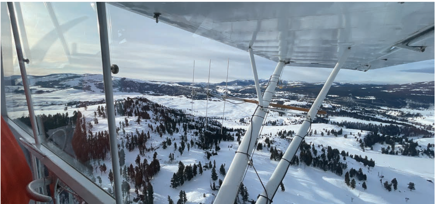
A winter view of Blacktail Plateau from the window of a Super Cub during a wolf tracking flight is spectacular.

At the beginning of 2023, 57 cow elk in YNP were radio-collared. Of these, 55 were GPS collars and two were VHF collars. There were 15 radio-collared elk mortalities documented this year. Six were killed by wolves, four died of malnutrition/exposure due to severe winter conditions