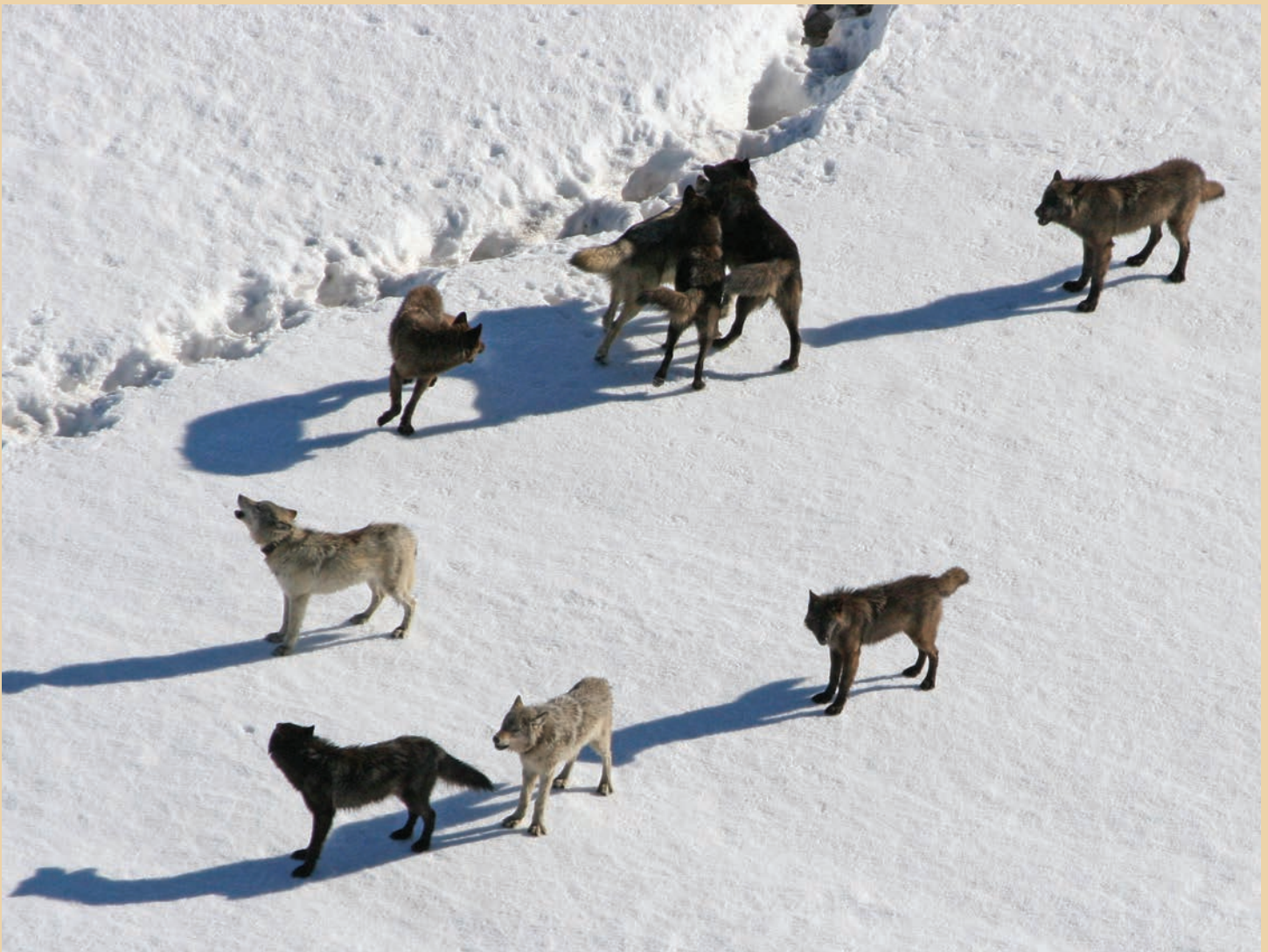
Wolf packs use howling as a means of communication both between and within packs. Often, a few howls by one wolf will trigger other wolves to join in, eventually leading to a chorus and a social greeting with pack mates. This often includes wagging tails, licking faces, and submission or dominance postures to reinforce social hierarchies and bonds.

recording units (ARUs) in efforts to monitor presence and distribution of wolves across the park. Accurate population and occupancy estimates play a vital role in the Yellowstone Wolf Project's objectives. Because wolf vocalizations carry for relatively long distances, the use of ARU's can enhance existing census efforts that largely involve monitoring radio-collared wolves and the packs to which they belong. As we move forward in our long-term efforts to monitor wolves, we seek to incorporate ever-advancing technologies and methods that are viable alternatives to radio collars.