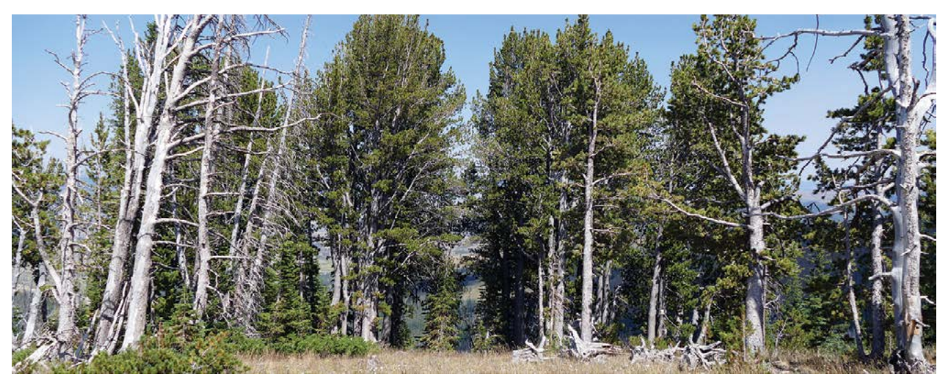
More than 1,500 plant taxa occur in Yellowstone National Park. The whitebark pine, shown here and found in high elevations in the Greater Yellowstone Ecosystem, is an important native species in decline.