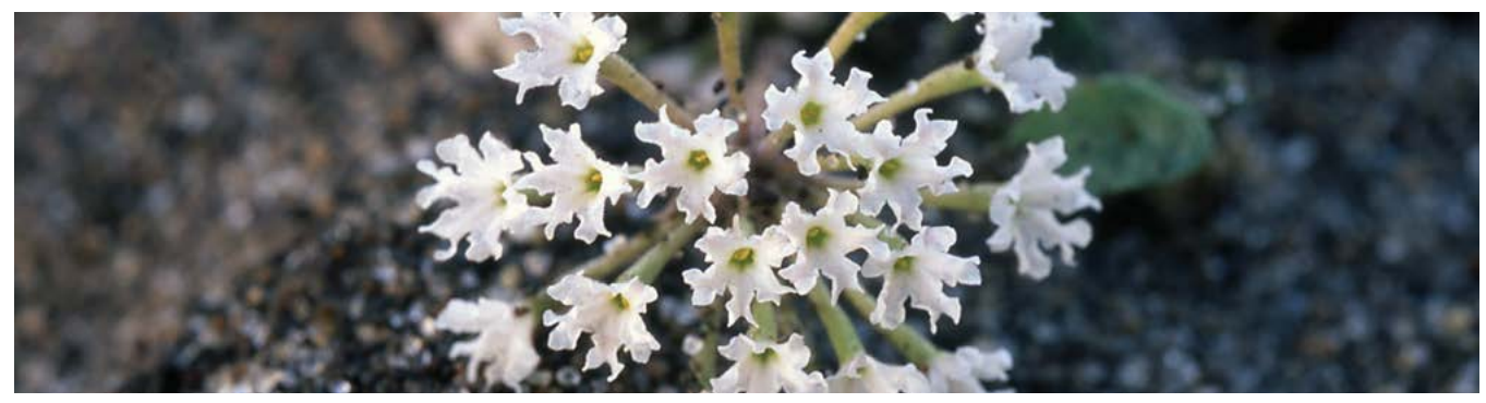
Yellowstone is home to three endemic plant species, or species that occur only in Yellowstone and nowhere else in the world. Yellowstone sand verbena, shown here, is only found along the shore of Yellowstone Lake.