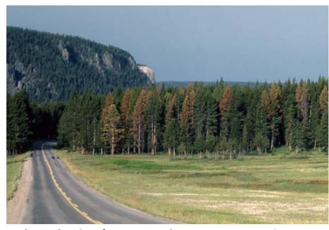
Lodgepole pine forests are the most common in Yellowstone. A lodgepole's serotinous cones need to be exposed to the high heat of a forest fire for the seeds to be released. Cones that do not disperse their seeds as a direct result of fire, open at the end of their second summer when seeds are mature.

The lodgepole's female cone takes two years to mature. In the first summer, the immature cones look like tiny, ruby-red miniature cones near the end of the branches. The following year, after fertilization, the cone starts to grow rapidly and turns a conspicuous green hue. Female cones will either open at maturity and subsequently release their seeds, or they remain closed. Cones that remain closed—a state known as serotiny—can hang on the branches for years until they are subjected to high heat such as a forest fire. Shortly after the tree ignites, the cones open, seeds are released over the charred area, and the forest has been in effect, replanted. Trees lacking serotinous cones (Engelmann spruce, subalpine fir, Douglas-fir, whitebark pine, and limber pine) rely on wind, animals, or other agents to distribute their seeds to other locations.