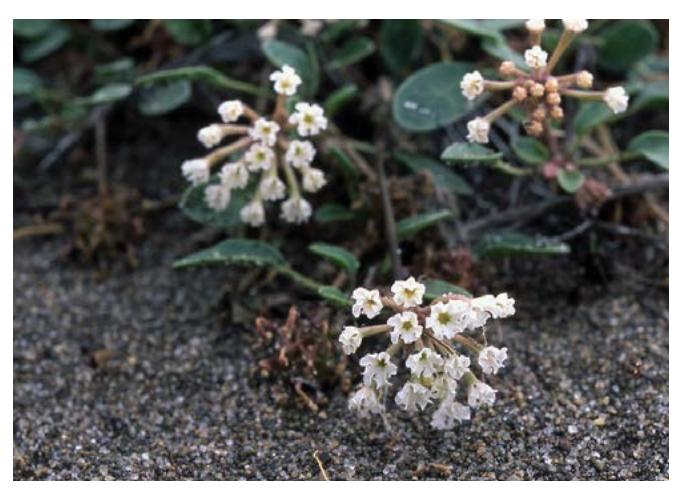
Yellowstone sand verbena in the park is isolated from other populations.

Although the species was once thought to be an annual, it has a significant taproot that in mature plants extends at least several feet deep. Sand verbenas as a group are known to be sensitive to disturbance, suggesting that increased activity on the lake