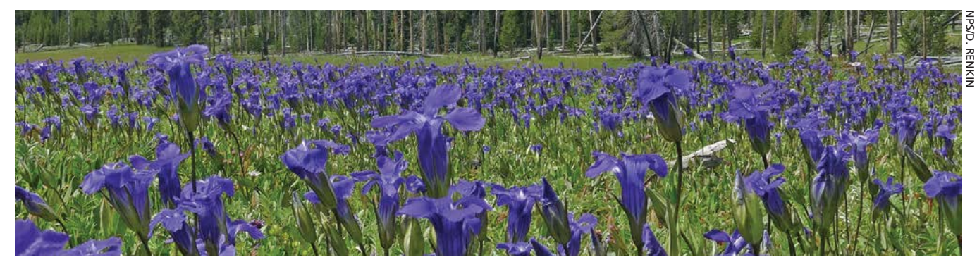
Fringed gentian (Gentianopsis detonsa), the park wildflower. The appearance of wildflowers announces spring in the park. Enjoy the wildflowers, but don't pick them.