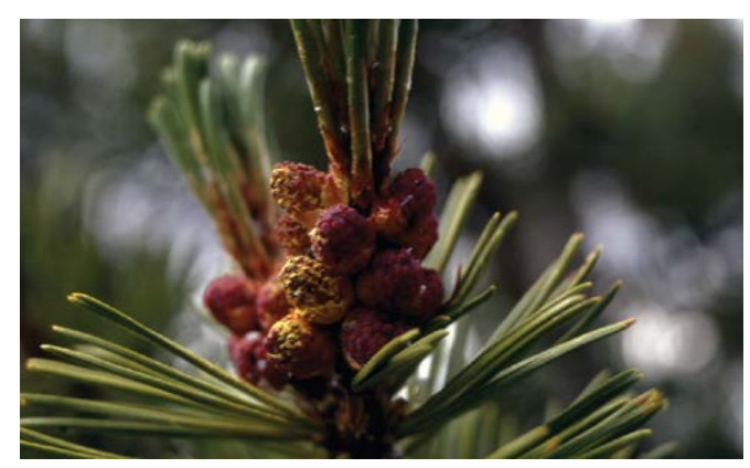
The needles of a whitebark pine are clustered in groups of five.

Aerial surveys, which measure the spatial extent of mortality rather than the percentage of individual dead trees counted on the ground, have generally produced higher whitebark pine mortality estimates in the Greater Yellowstone Ecosystem. This could be because larger trees, which occupy more of the area in the forest canopy visible from the air, are more likely to be attacked by beetles, which prefer larger trees for laying their eggs. In 2013, an aerial survey method called the Landscape Assessment System was used to assess mountain pine beetle-caused mortality of whitebark pine across the region. Results of the one-time study indicate that nearly half (46%) of the GYE whitebark pine distribution showed severe mortality, 36% showed moderate mortality, 13% showed low mortality, and 5% showed trace levels of