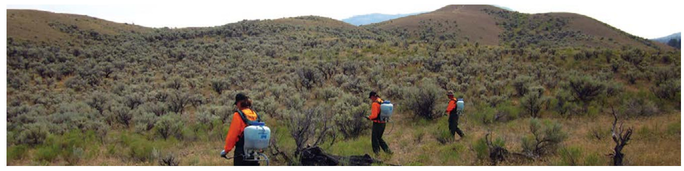
Yellowstone works to prevent the spread of invasive plant species, which can displace native species, change vegetation communities, affect fire frequency, and impact food for wildlife.