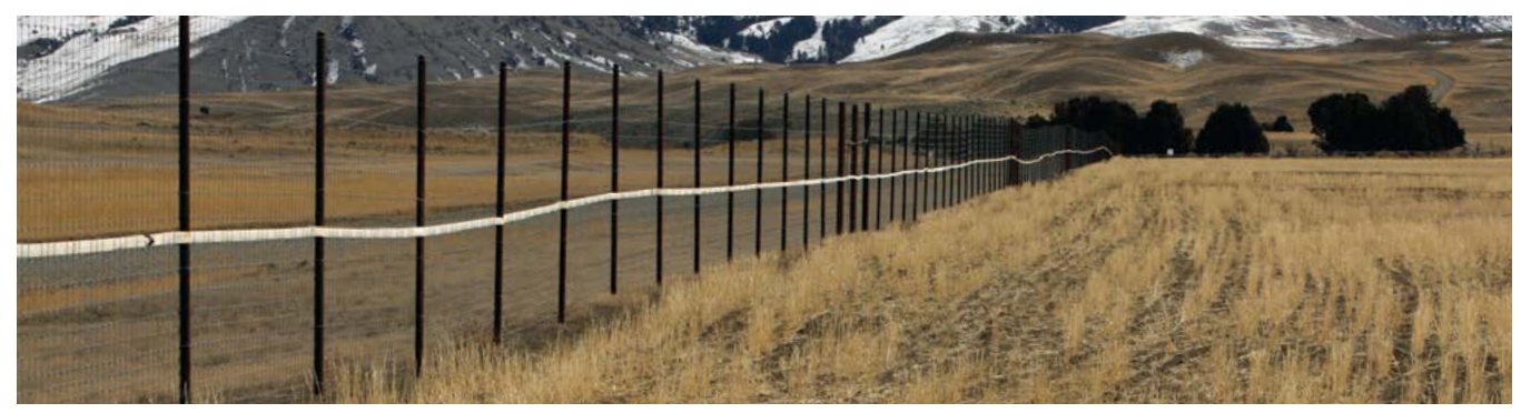
Park managers sometimes restore disturbed areas infested by invasive nonnative plants to native vegetation. The area enclosed by this sturdy fence was an irrigated field; park managers are restoring native plants here.

communities. Based on program priorities for species, the equivalent of 103 acres of pure non-native plant populations was treated during 2022. Physical removal is the preferred method of control when feasible, but pulling or cutting of some of the perennial species serves to stimulate new growth, and the use of herbicides becomes necessary to control aggressive species over large areas. Manual pulling efforts in 2022 totaled three acres as these efforts were limited to small, isolated patches along road corridors and in bison brucellosis quarantine facilities. Most of the 36 species targeted for treatment are listed by the states of Idaho, Montana, or Wyoming as "noxious weeds," which means they are detrimental to agriculture, fish and wildlife, aquatic navigation, or public health.