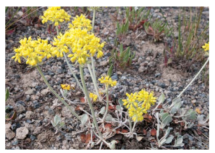
Yellowstone sulphur flower wild buckwheat is only found in Yellowstone National Park.

Yellowstone sulphur flower is adapted to survive on barren, slightly geothermally influenced open areas.