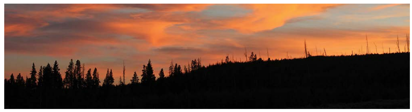
Douglas-fir forests occur at lower elevations and are associated with the Lamar, Yellowstone, and Madison river drainages in Yellowstone National Park.