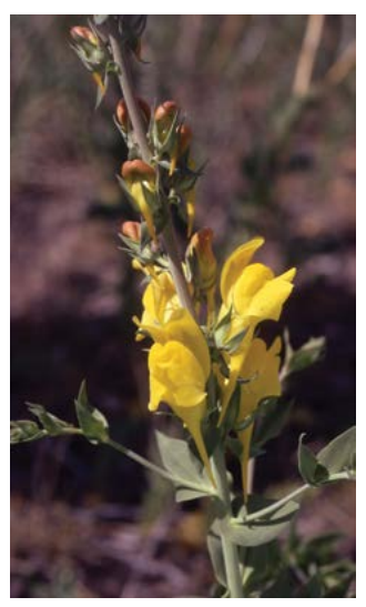
Dalmation toadflax (Linarea dalmatica) is an invasive species common along trails and roads. Improper removal techniques can actually spread infestations further.

Exotic plants—escaped domestics and "weeds"—can be found in Yellowstone. Look for them in disturbed sites such as roadsides where they have little initial competition and frequent redisturbance. Dalmation toadflax (Linarea dalmatica), yellow sweetclover (Melilotus officinalis), ox-eye daisy (Leucanthemum vulgare), and other exotics compete with native plants. For this reason, and for the continued integrity of the Yellowstone ecosystem, these exotics are controlled.