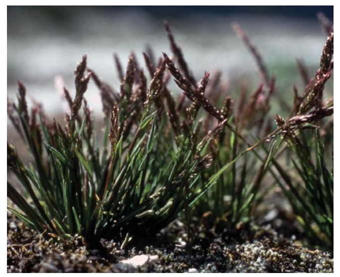
Ross's bentgrass is native to the geyser basins along the Firehole River.

especially heat tolerant. It survives only in thermal areas because their lethal summer temperatures impose a short growing season advantageous to annual plants with precocious flowering and prevent competition from slower growing perennials.