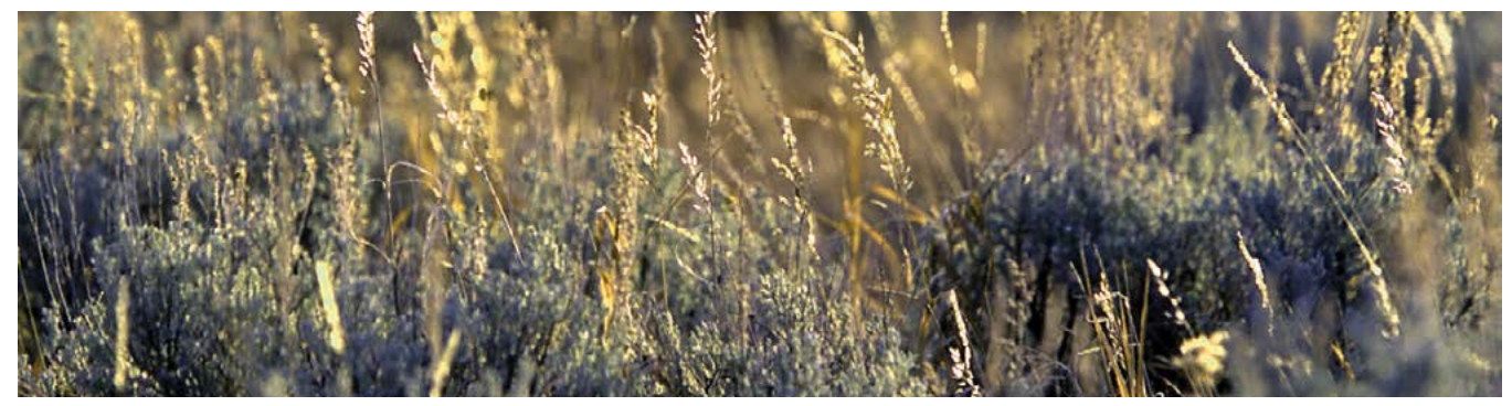
Other vegetation communities in Yellowstone include sagebrush-steppe, wetlands, and hydrothermal communities. Sagebrush-steppe occurs in the northern range in Yellowstone.