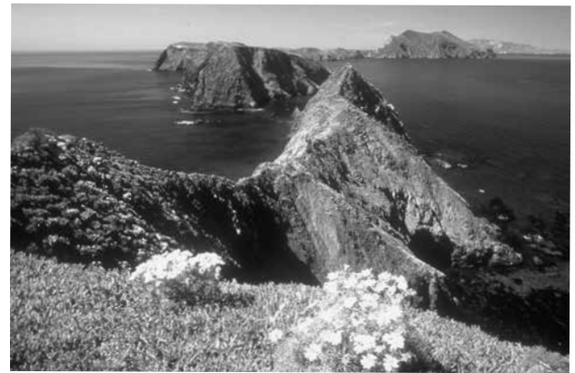
Inspiration Point