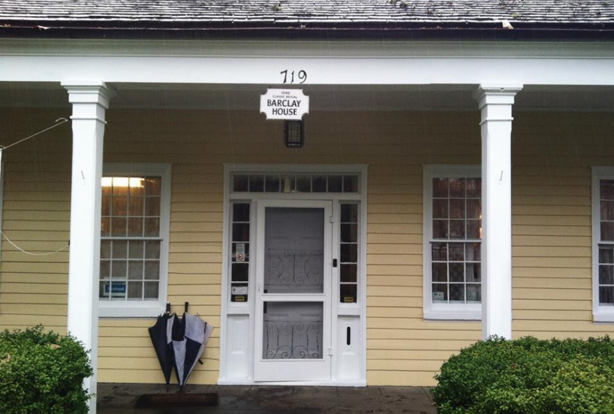
The Barclay House was one of several buildings at the park to be repainted in 2016. The choice of color was based on a historic paint layer on the house.