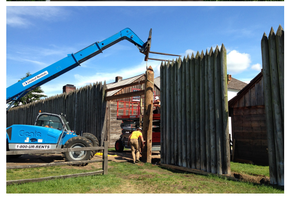
For the past 30 years, the National Park Service has worked with the Oregon State University College of Forestry to monitor the condition of individual wooden posts in the fort palisade. In 2016, posts with advanced rates of decay, as well as the fort gate, were replaced.