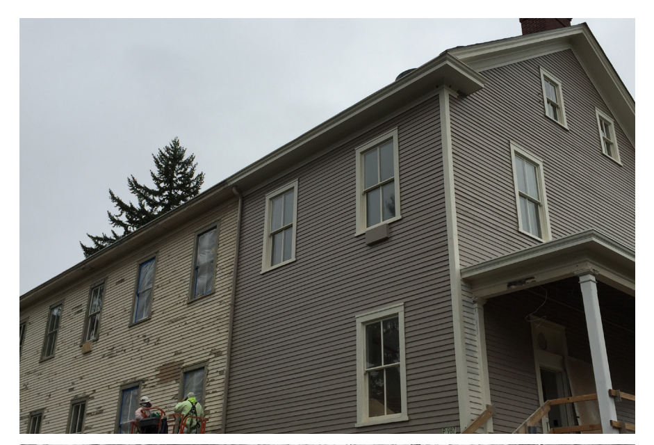
At Building 987, contractors restored historic windows and doors, uncovered the building's original wood floors, removed lead paint, and installed seismic support systems and accessibility features.