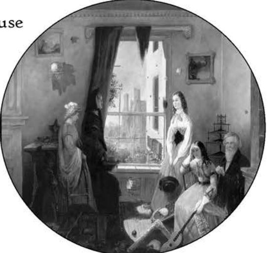
A family returns to their home in Fredericksburg after the battle.

What would you do if a battle was fought at your house?