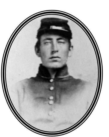
George Sawtell Vermont Grave # 680