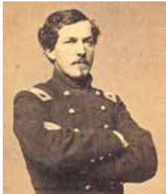
Nelson A. Miles