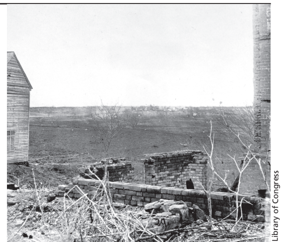
View of the open vista toward Ellwood Manor from the remains of Wilderness Tavern

War arrived on the threshold of Wilderness Tavern in May 1863, as Union troops marched east to Chancellorsville. Days later, this area became the Confederate rear after Thomas "Stonewall" Jackson's flank attack.