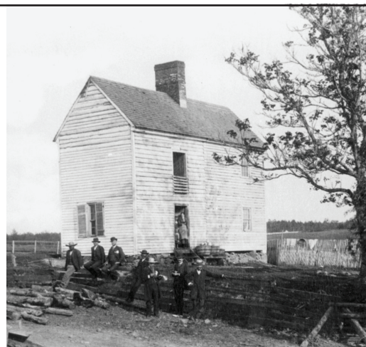
The Wilderness Tavern dependency building photographed in 1884

Cross over Lyons Lane (a private road—please do not walk along the road) to the trail climbing the hill in front of you. Stop by the chimney at the top of the hill. These remains are all that is left of a dependency building for Wilderness Tavern, which stood beneath modern Virginia Route 3.