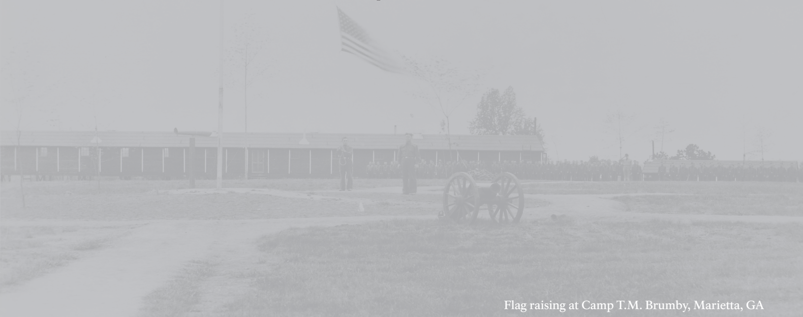
Flag raising at Camp T.M. Brumby, Marietta, GA