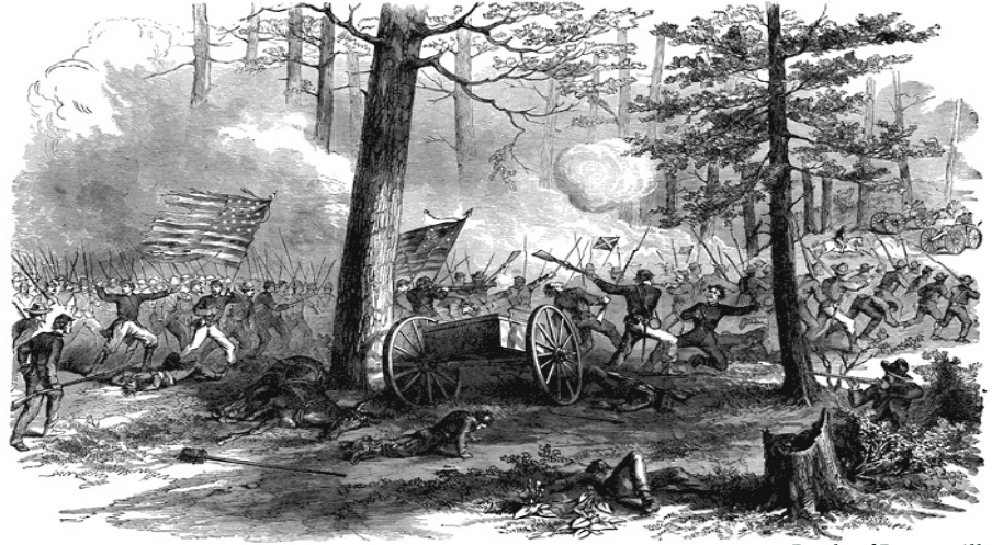
Battle of Bentonville

Confederate armies. Knowing Johnston's abilities, he quickly overruled Davis's objections and recalled him as commander of the Army of Tennessee, and all troops in the Carolinas, Georgia, and Florida.