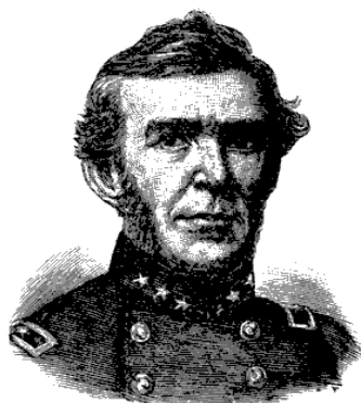
General Braxton Bragg

Nevertheless, Johnston was chosen to replace General Braxton Bragg as commander of the Army of Tennessee. The army had suffered numerous defeats under its former commander. Its morale was low, its ranks were thinned, and it was inadequately supplied with food and clothing. The new commander however, was popular with the officers and men, and did much to restore the army to a formidable fighting force. Soon he became affectionately known to his men as “Old Joe.”