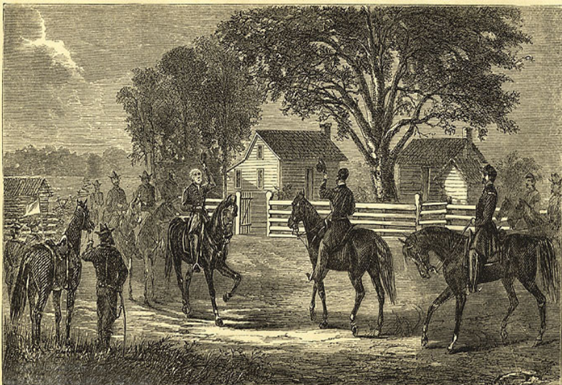
CONFERENCE BETWEEN GENERAL SHERMAN AND GENERAL JOHNSTON.

Conference Between General Sherman and General Johnston