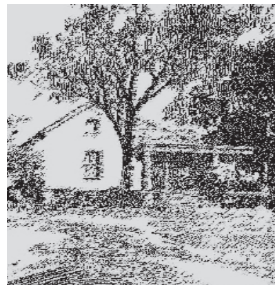
The Hardage Home, 1864