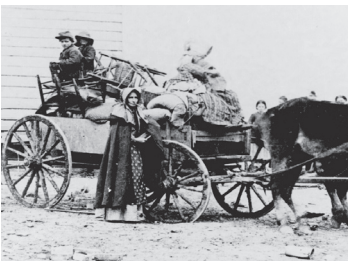
Refugees fleeing a war zone in the 1860s.