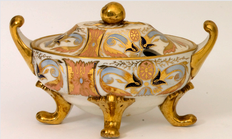
Above: Sauce Tureen, Hampton National Historic Site, HAMP 17546.