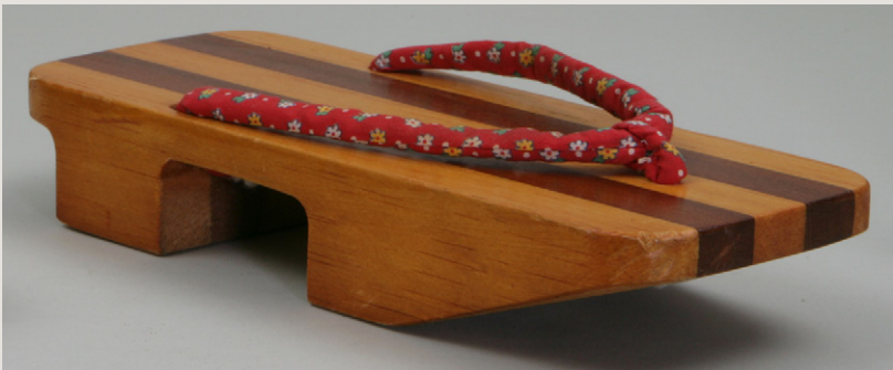
Above: Sandals [Geta], Manzanar National Historic Site, MANZ 4124.