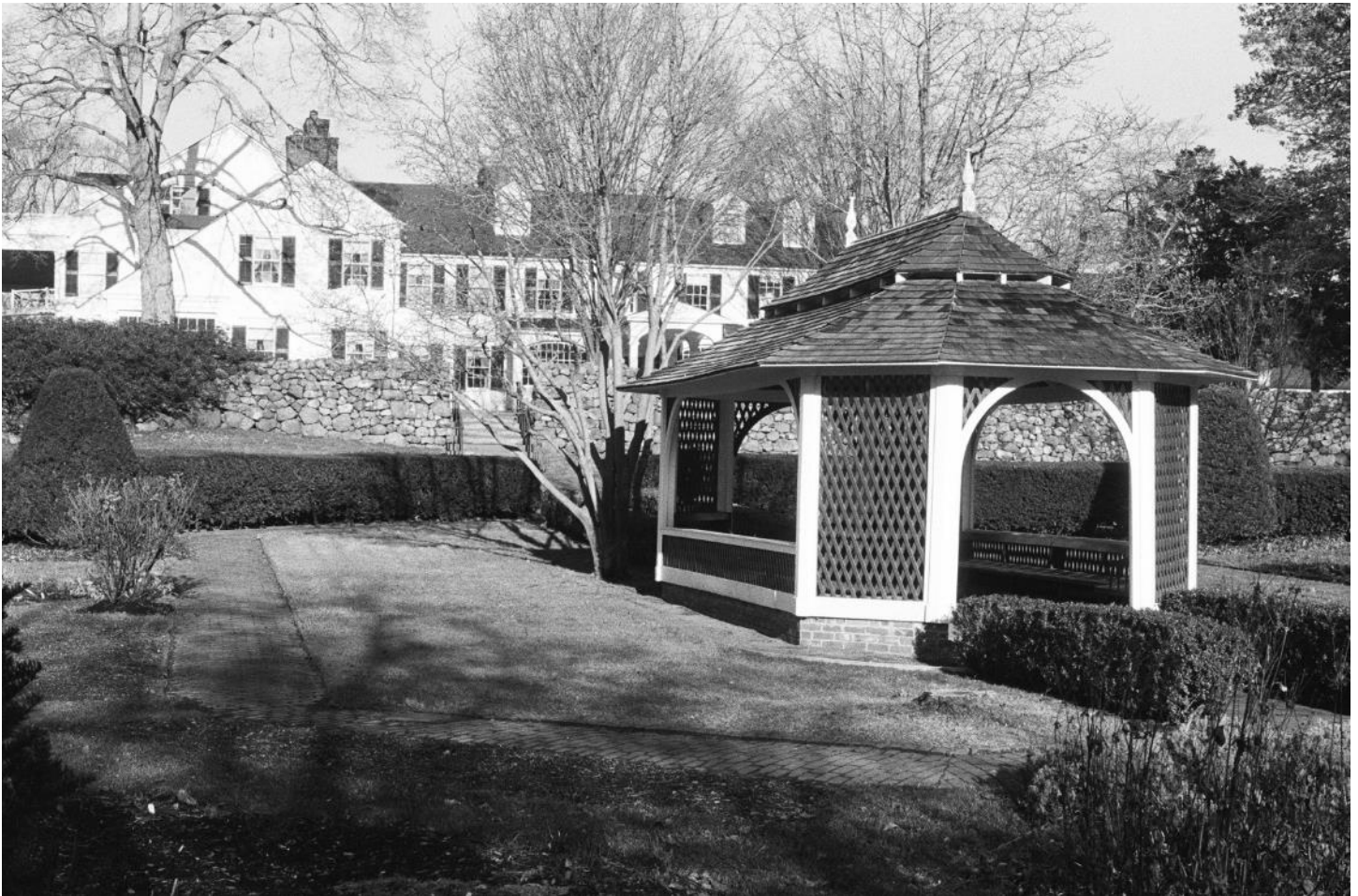
Photo 5. Sunken garden and summer house, looking northeast toward Hill-Stead.

National Historic Landmarks Nomination Form