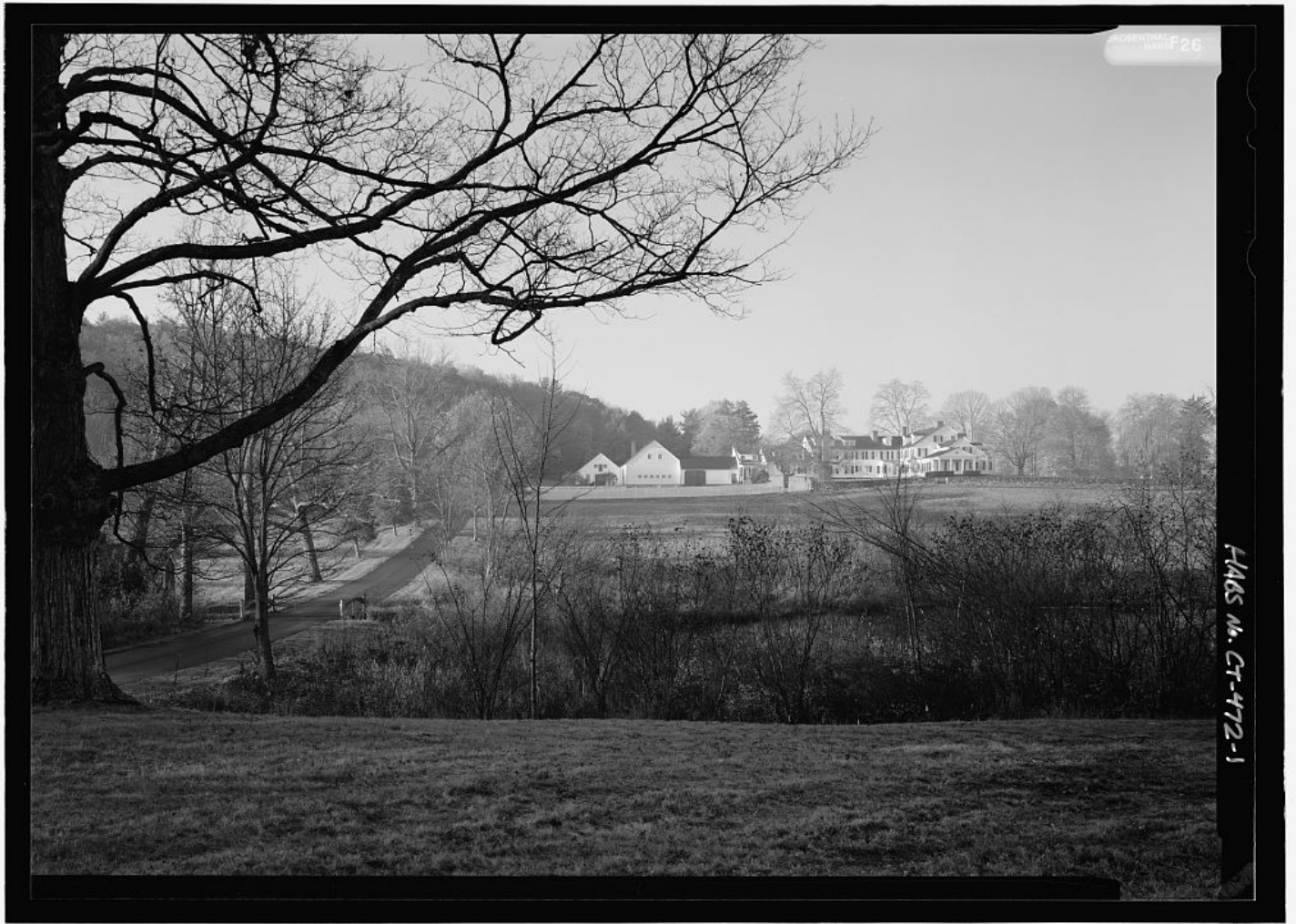
Photo 1. General View of Hill-Stead (Pope-Riddle House)—complex and landscape from east/northeast. HABS CT-472-1, 2006.

National Historic Landmarks Nomination Form