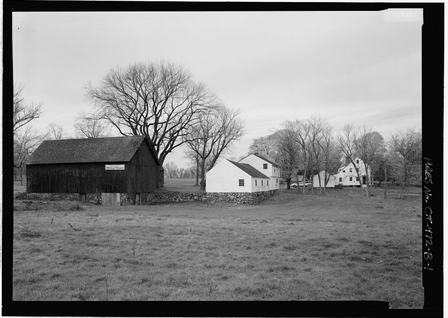
Photo 8. Farm complex from east. HABS CT-472-B-1, 2006.

National Historic Landmarks Nomination Form