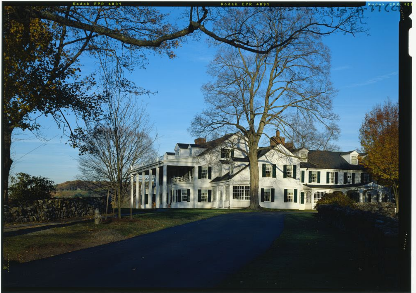
Photo 2. Perspective view of Hill-Stead from west on carriage drive. HABS CT-472-A-77, 2006.

National Historic Landmarks Nomination Form