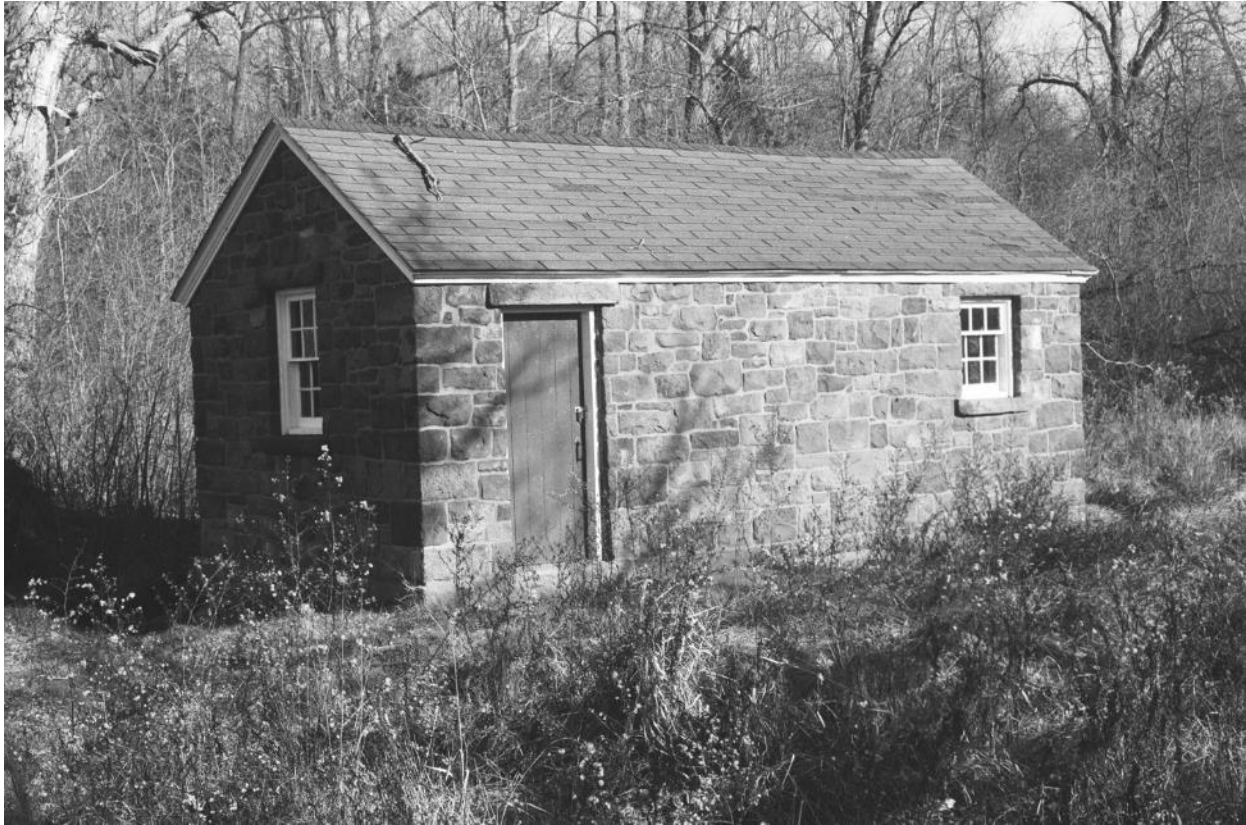
Photo 13. Pump House, looking northwest. Photograph by Peter Aaslestad, September 2017.

National Historic Landmarks Nomination Form