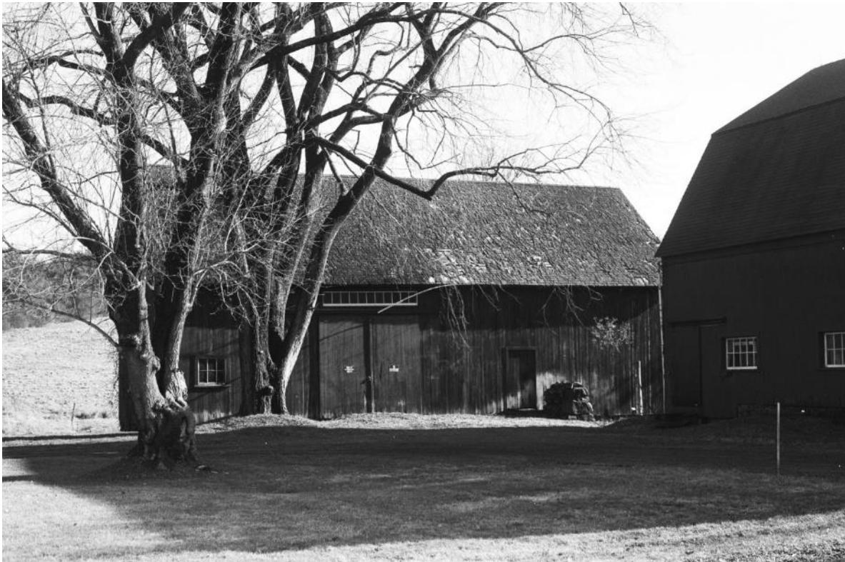
Photo 10. Horse Barn, looking south with end of hay barn on right. Photograph by Peter Aaslestad, September 2007.