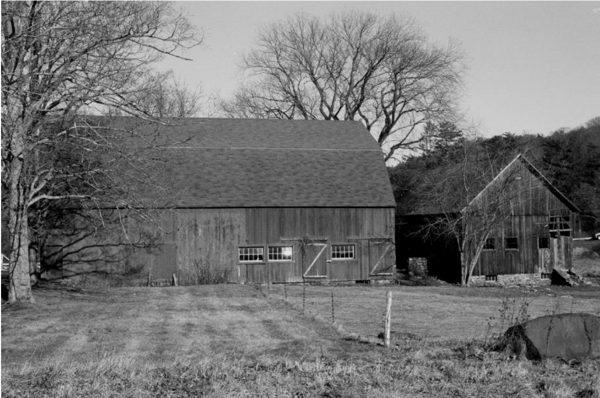
Photo 11. Hay Barn (left) with end of horse barn on right, north view. Peter Aaslestad photo, September 2007.

National Historic Landmarks Nomination Form