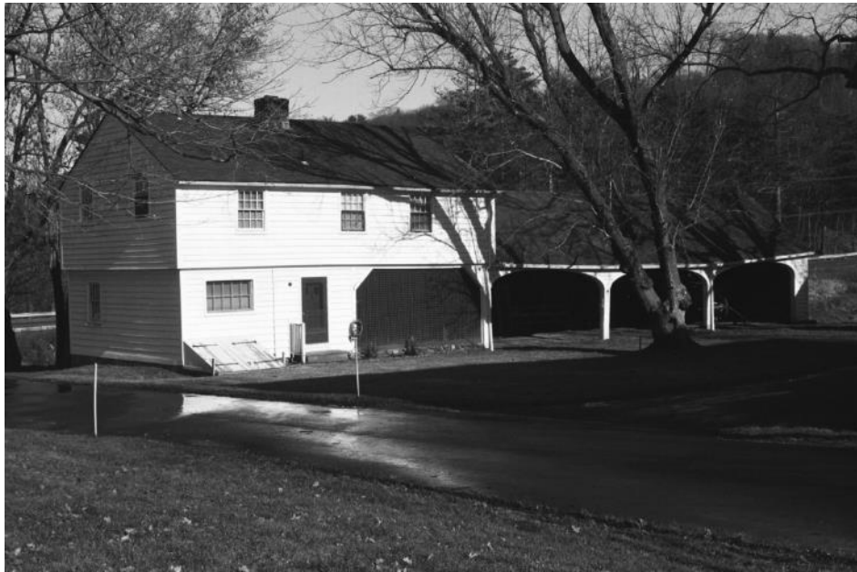
Photo 9. Shepard's Cottage, looking southwest.

National Historic Landmarks Nomination Form