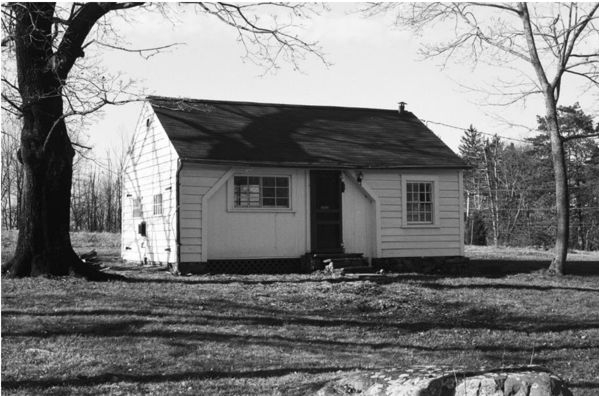
Photo 12. Summer House, looking northwest. Photograph by Hill-Stead staff, 2011.