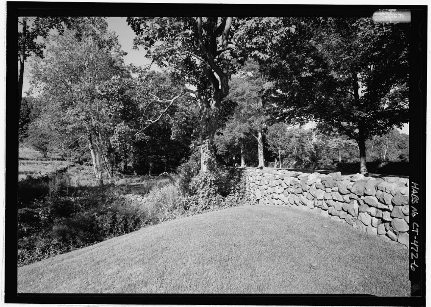
Photo 7. View of former wild garden from east with stone wall along carriage drive on right. HABS-CT-472-b, 2006.

National Historic Landmarks Nomination Form