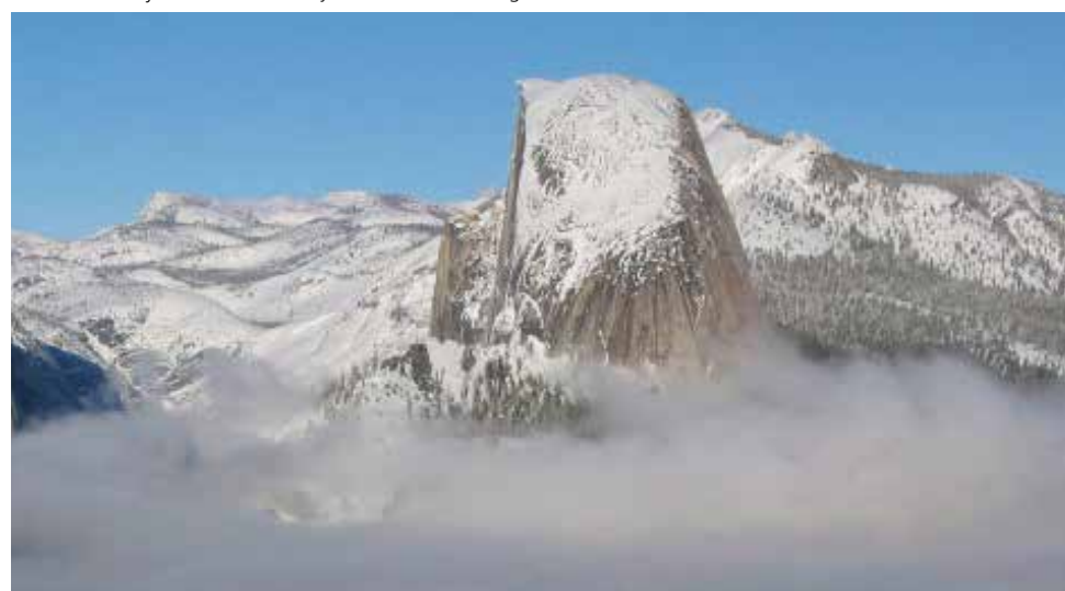
The view from Glacier Point.