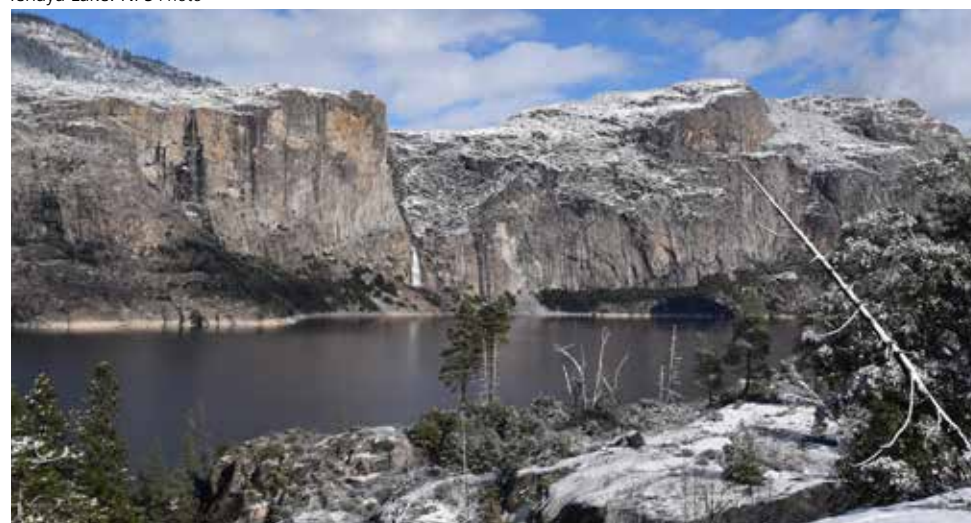
Hetch Hetchy Reservoir.