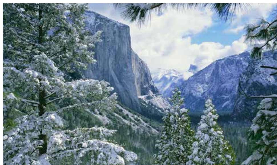
Yosemite Valley in Winter.