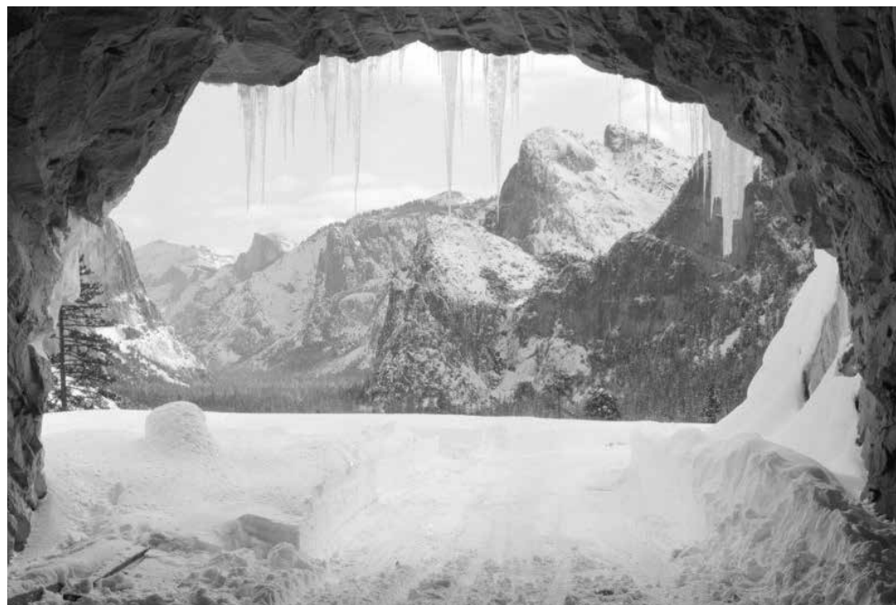
RL_02956 Yosemite Valley from Wawona Tunnel in winter.

Many visitors are already finding that these images are fun to peruse and explore from home. As a result of these images being available online, there's been a growing trend of visitors taking modern shots of the park mirroring the views featured in one of the many historic photographs, and posting the modern versus historic photographic comparison on social media. Yosemite would love to see your modern retakes! Visitors should feel proud to express their creativity and show their love of Yosemite by sharing their photo comparisons with us on Twitter, Facebook, or Instagram using #YosemiteArchives and #YosemiteFindYourArchives. However you decide to use these images, we hope you enjoy them as much as we do!