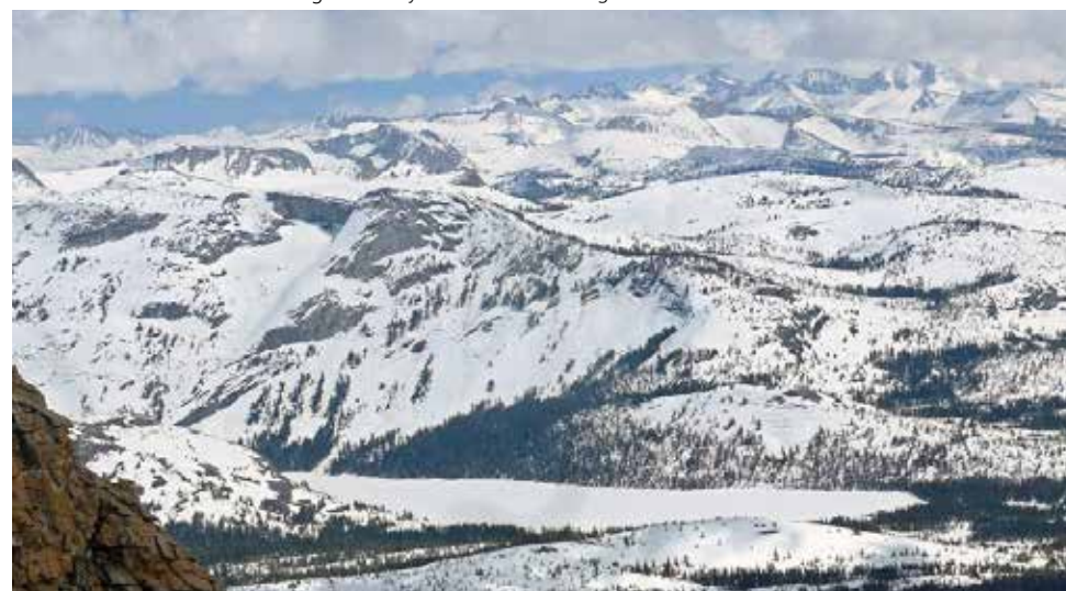
Tenaya Lake.