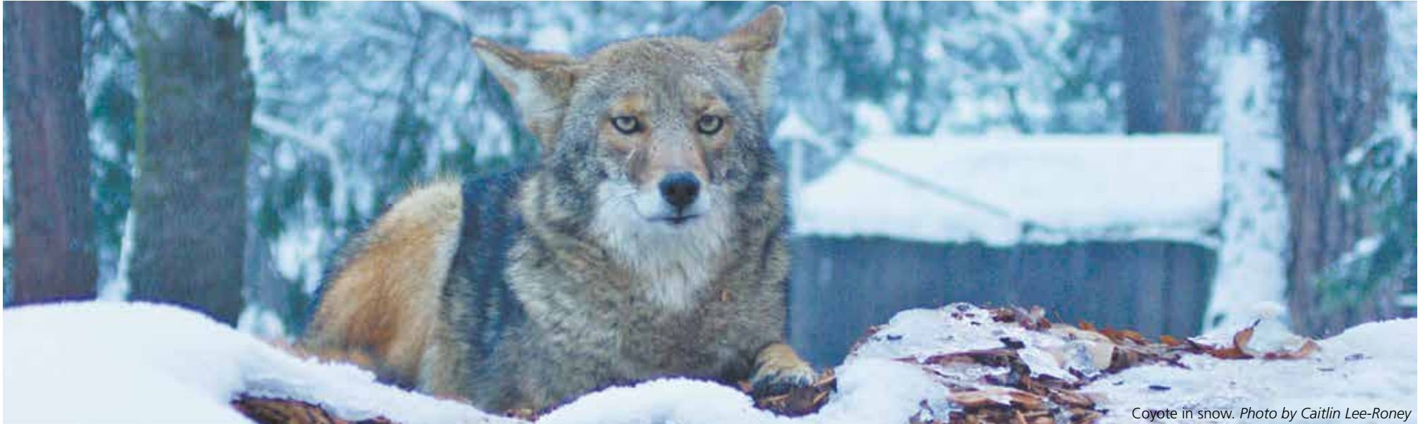
Coyote in snow.