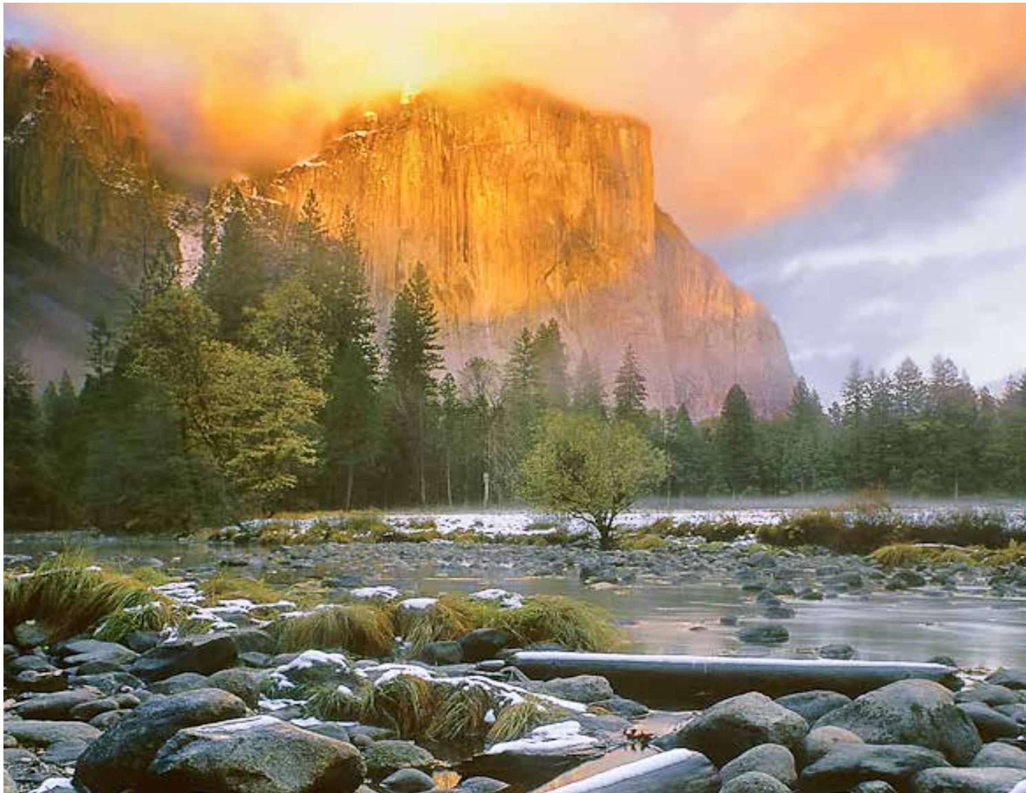
Gates of the Valley, Winter