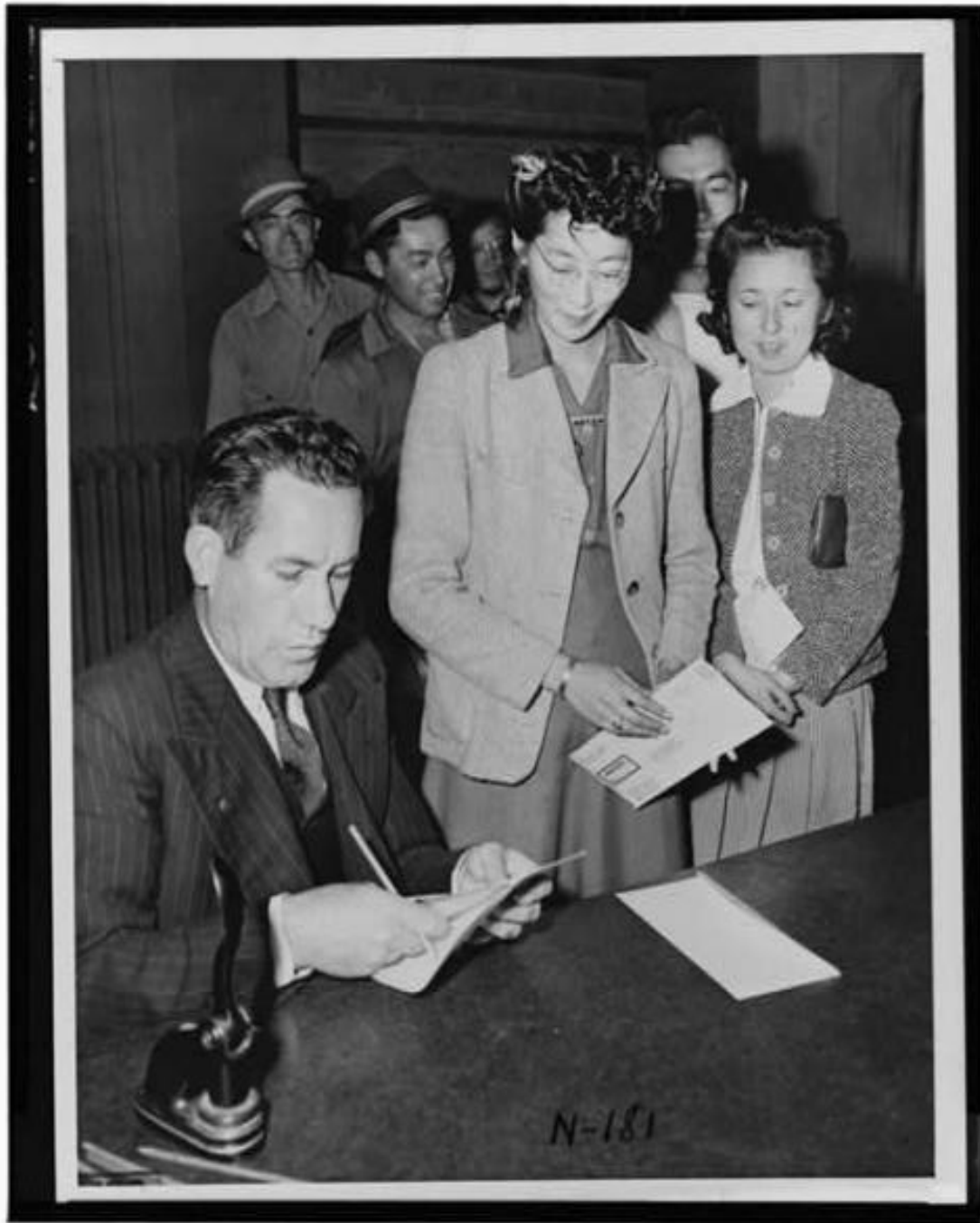
The city clerk of San Bruno, California accepts absentee ballots of Japanese American evacuees during a state election, 1942.